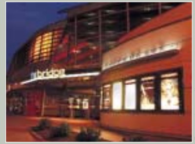
The Bridge Cinema de Lux at 40th & Walnut streets.