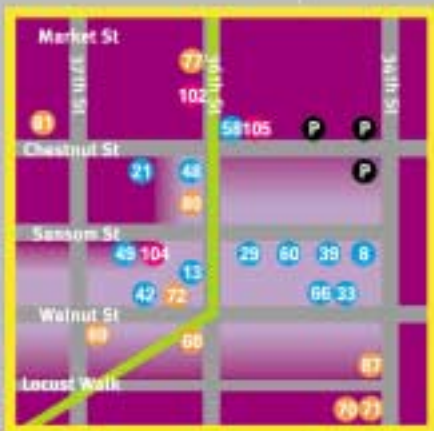
Area of inset