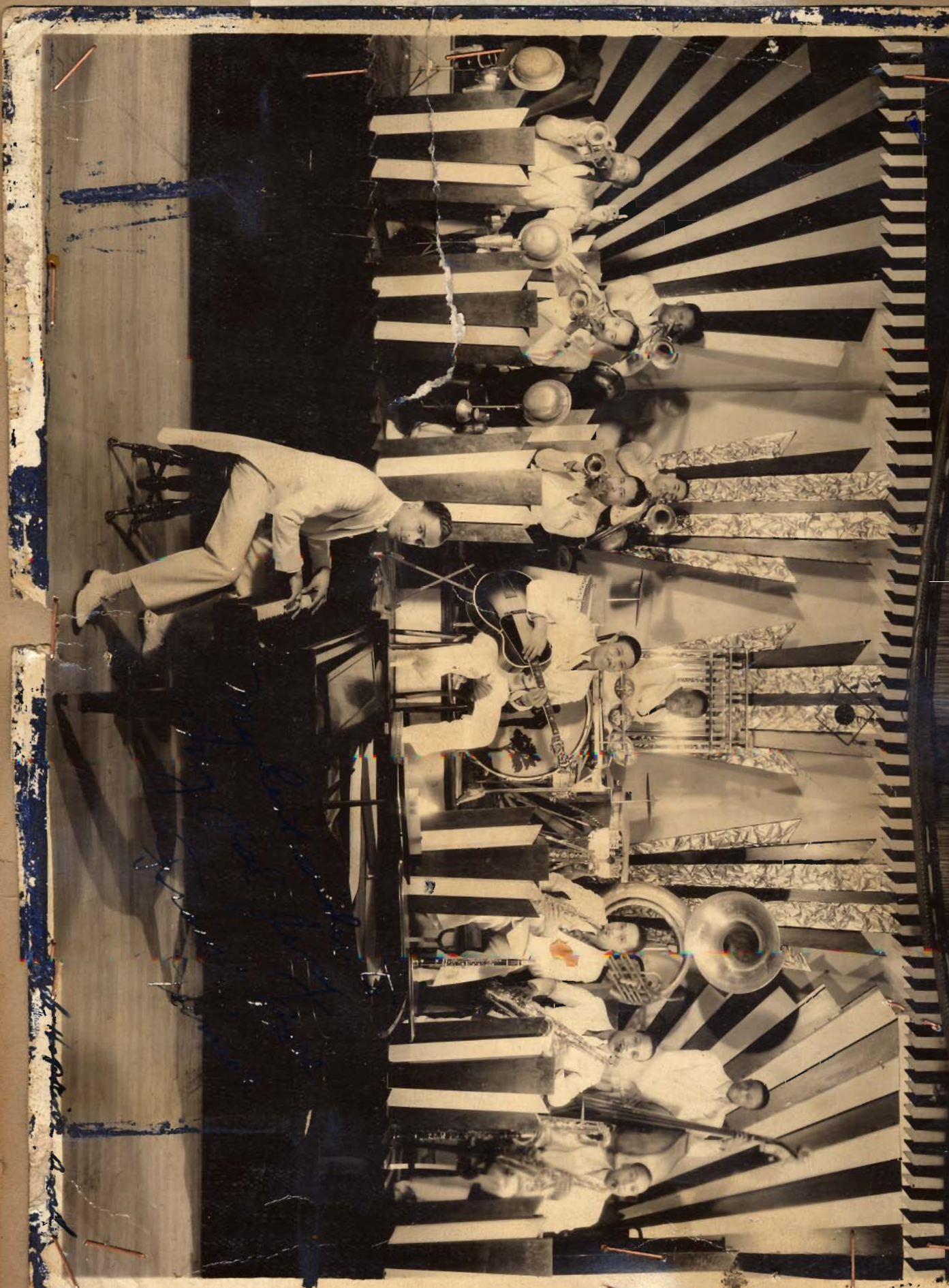
My favorite band