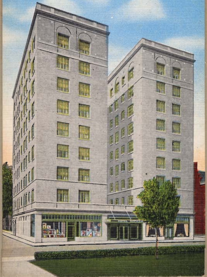
GOTHAM HOTEL, JOHN R. ST. AND ORCHESTRA PLACE DETROIT, MICH.