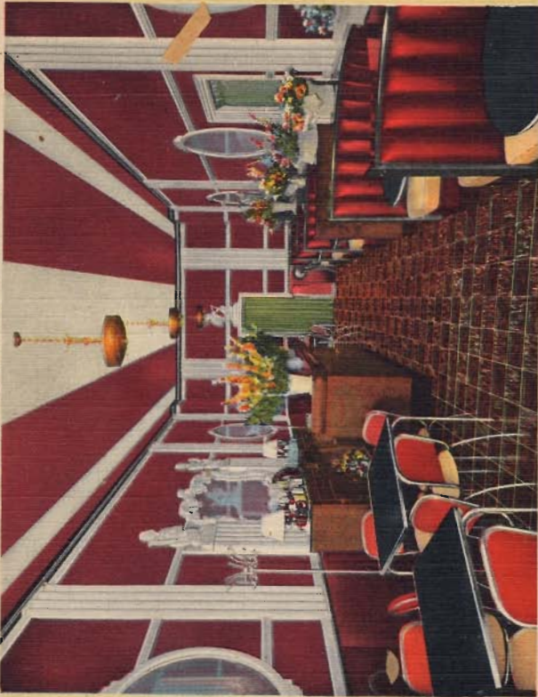
410 E. 47th ST. — CHICAGO, ILL. — Tel. DRExel 4673