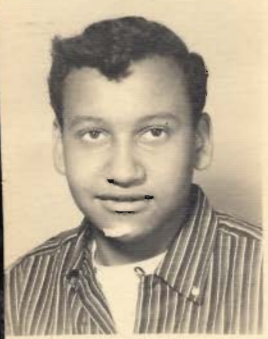
SCHOOL DAYS 1959-60